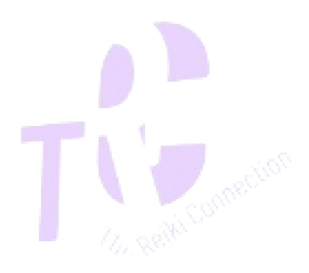
For Everything Reiki